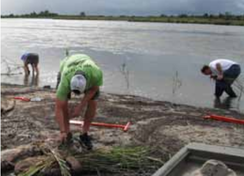
BTNEP used their grant to purchase a boat to transport volunteers and plants to shallow coastal marshes for restoration projects.