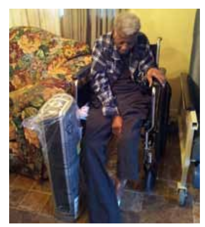
With a 2014 grant from BCF, the Terrebonne Council of Aging distributed 86 personal heaters to needy elderly.

We invite you to be a part of this exciting philanthropic story with a new or continued gift to BCF. Thank you for helping us grow and strengthen our community!