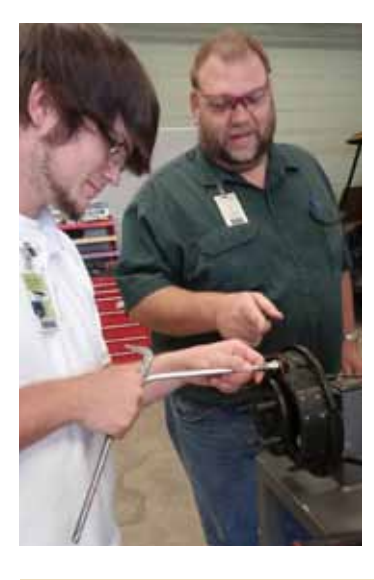
The Lafourche Parish School District purchased a hydraulic brake system to train high school automotive students and help them be job-ready.