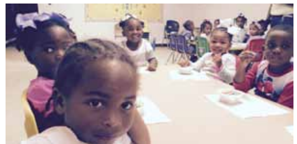
BCF grantee St. Lucy Day Care Center was a stop on our first-ever BCF Bus Tour.